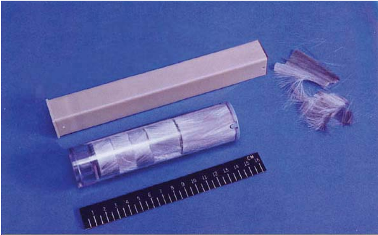
Figure 1. Radio frequency chaff cartridges (Air Force version RR-188/AL, top; Navy version RR-144/AL, bottom) and chaff fibers (right). Fibers of different lengths can be seen in the Navy operational version (clear cylinder). These lengths correspond to the frequency modes of the radar spectrum. In training, however, cartridges containing only 1.8 cm fibers are used (not shown).