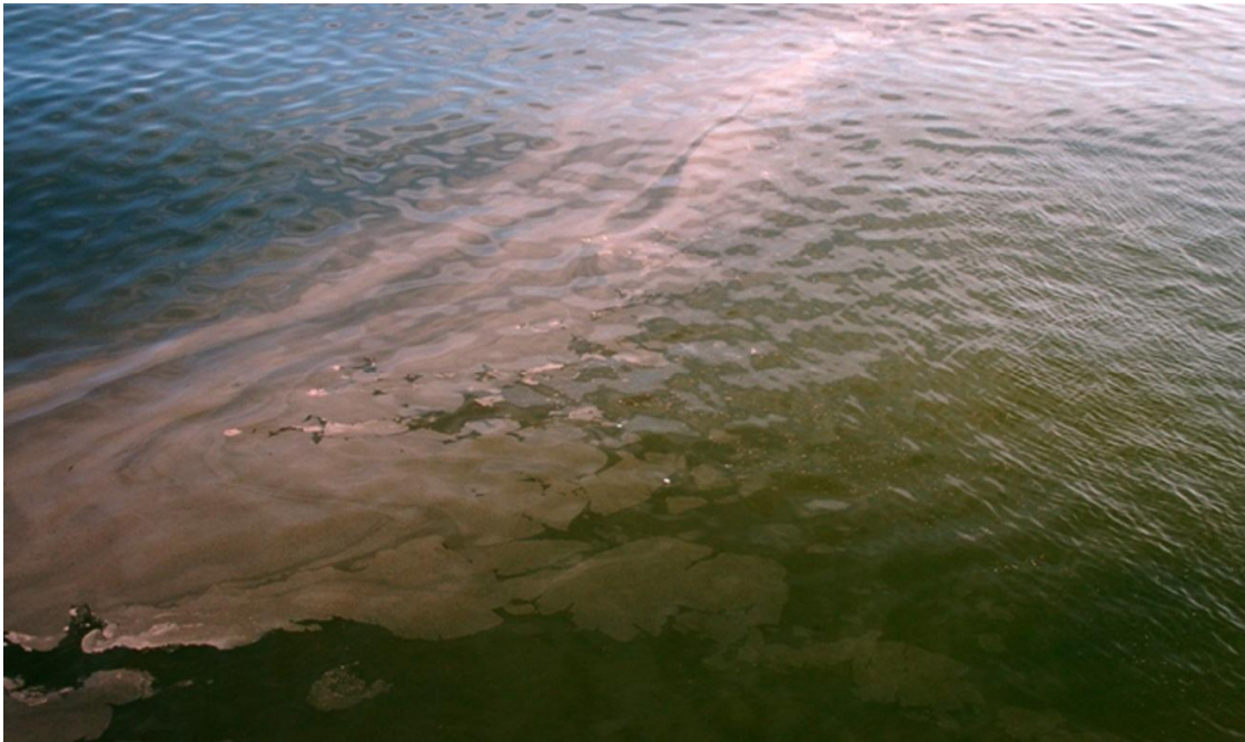
Fig. 1. Karenia brevis and Trichodesmium erythraeum Bloom, Offshore Lee County, Florida (USA), October 22, 2007.