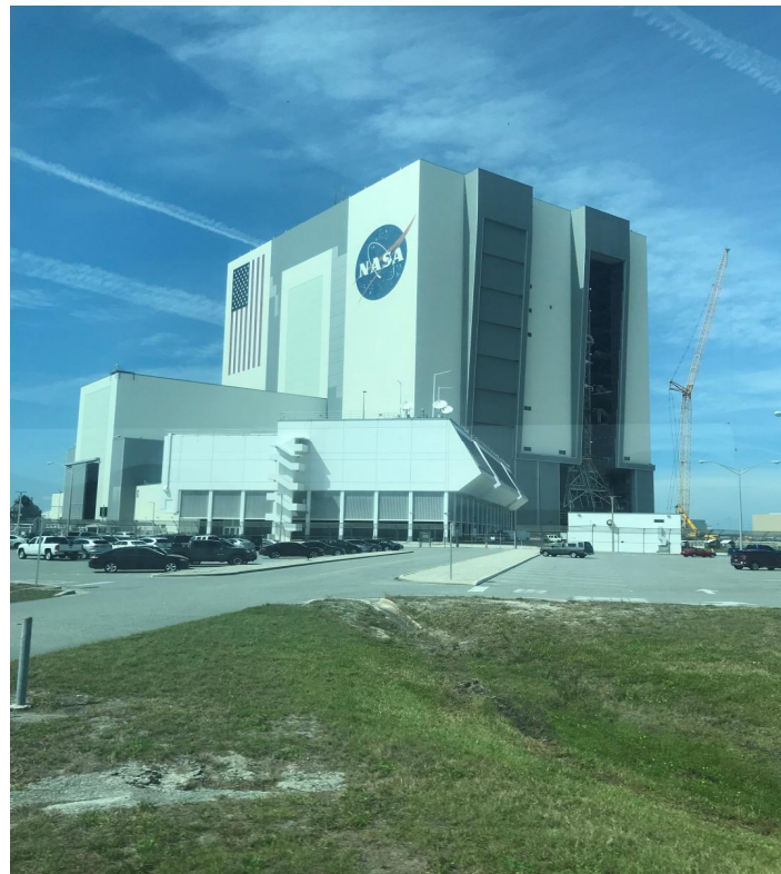
Fig. 4. Exterior view of NASA's Launch Control Center at Kennedy Space Center, Cape Canaveral, Merritt Island, Florida against a sky filled with jet-emplaced particulate geoengineering trails

In a time span of a few minutes to hours the trails spread out, for a time resembling cirrus clouds, before further spreading-out to become a white haze in the sky [27]. The fine-grained particles mix with and contaminate the air we breathe and settle to earth, slowly poisoning the soil and bodies of water [28].