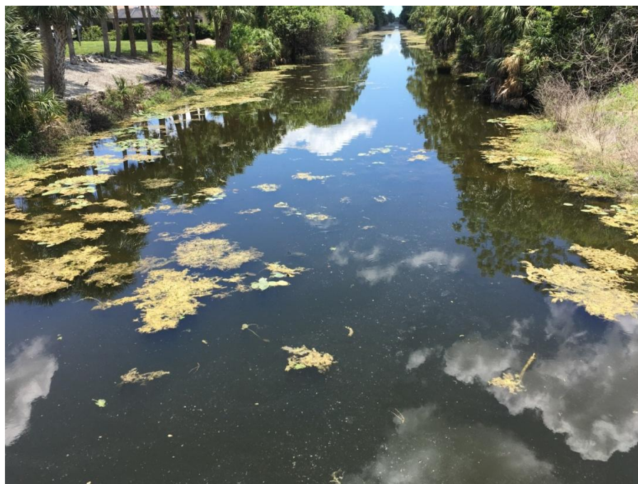
Fig. 5. Blue-green algae along shore of residential canal – Port Charlotte, Southwest Florida. May 20, 2019

Cyanobacteria are often called “blue-green algae,” but they are actually photosynthetic prokaryotes with no direct relationship to higher algae (Figs. 5 and 6). Throughout their long evolutionary history, cyanobacteria have diversified into a great many species with various morphologies and niche habitats. They occur as unicellular, surface attached, filamentous, colonial, and mat-forming species, and they inhabit diverse freshwater and marine systems across a wide range of eutrophic and oligotrophic conditions [61].