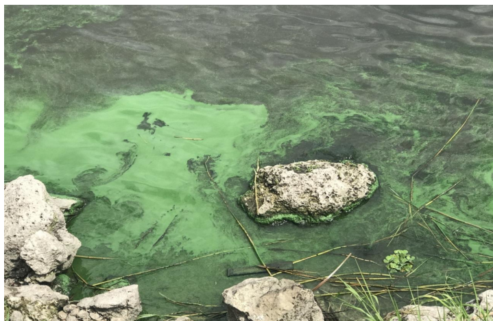
Fig. 6. Blue-green (cyanobacteria) bloom – Eastern shore of Lake Okeechobee near Pahokee, Florida. May 17, 2019

High nutrient loading, rising temperatures, enhanced stratification, increased residence time, and increased salinity all favor cyanobacterial dominance in many of these aquatic ecosystems [62]. Cyanobacteria resist pollution and are even used in so-called “photoremediation,” or bioleaching of heavy metals from coal fly ash [63]. Cyano-HABs have serious adverse effects on human and environmental health that are projected to expand and worsen with demographic and climate changes [64] and increased aerial particulate pollution.